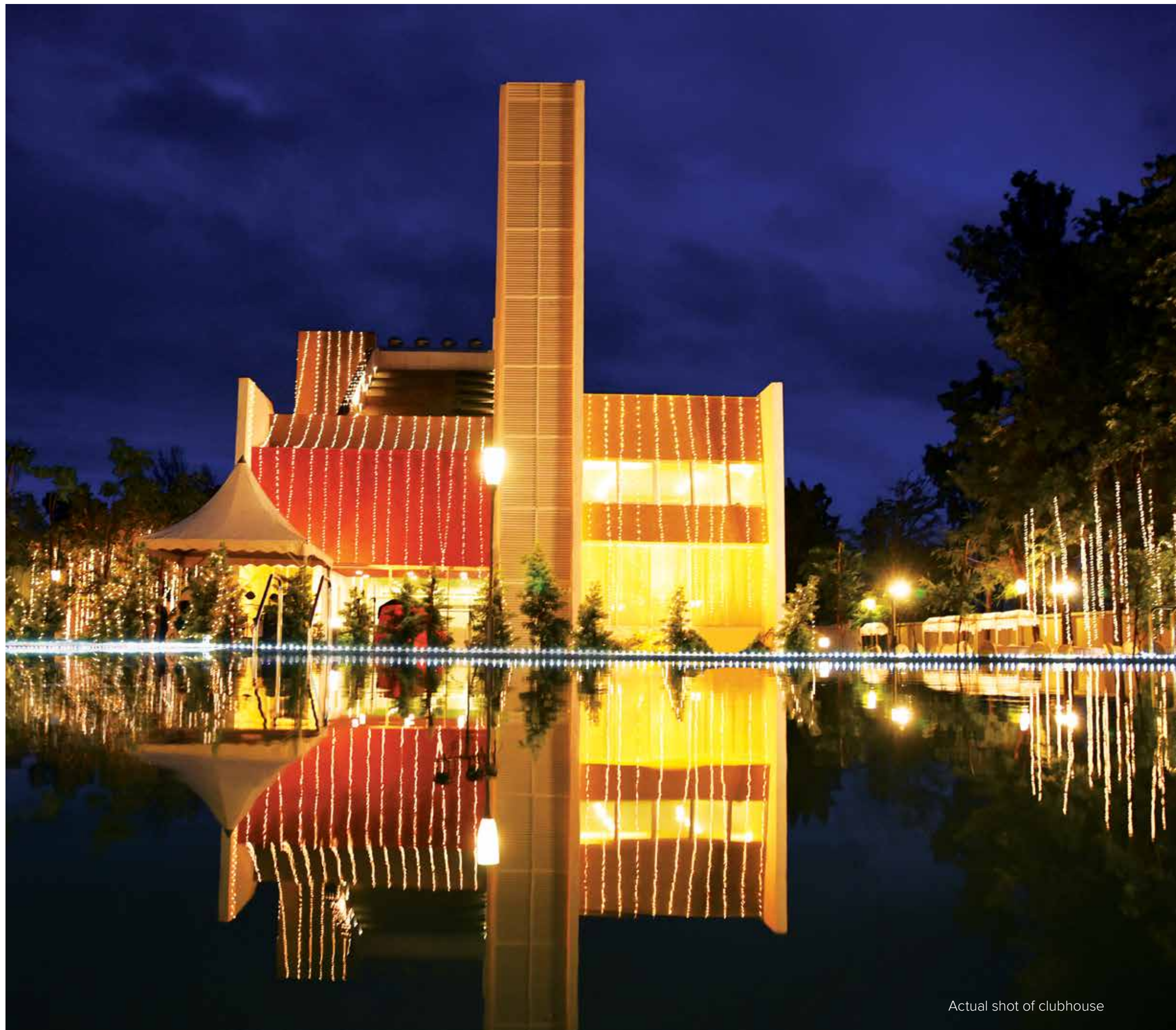
Actual shot of clubhouse