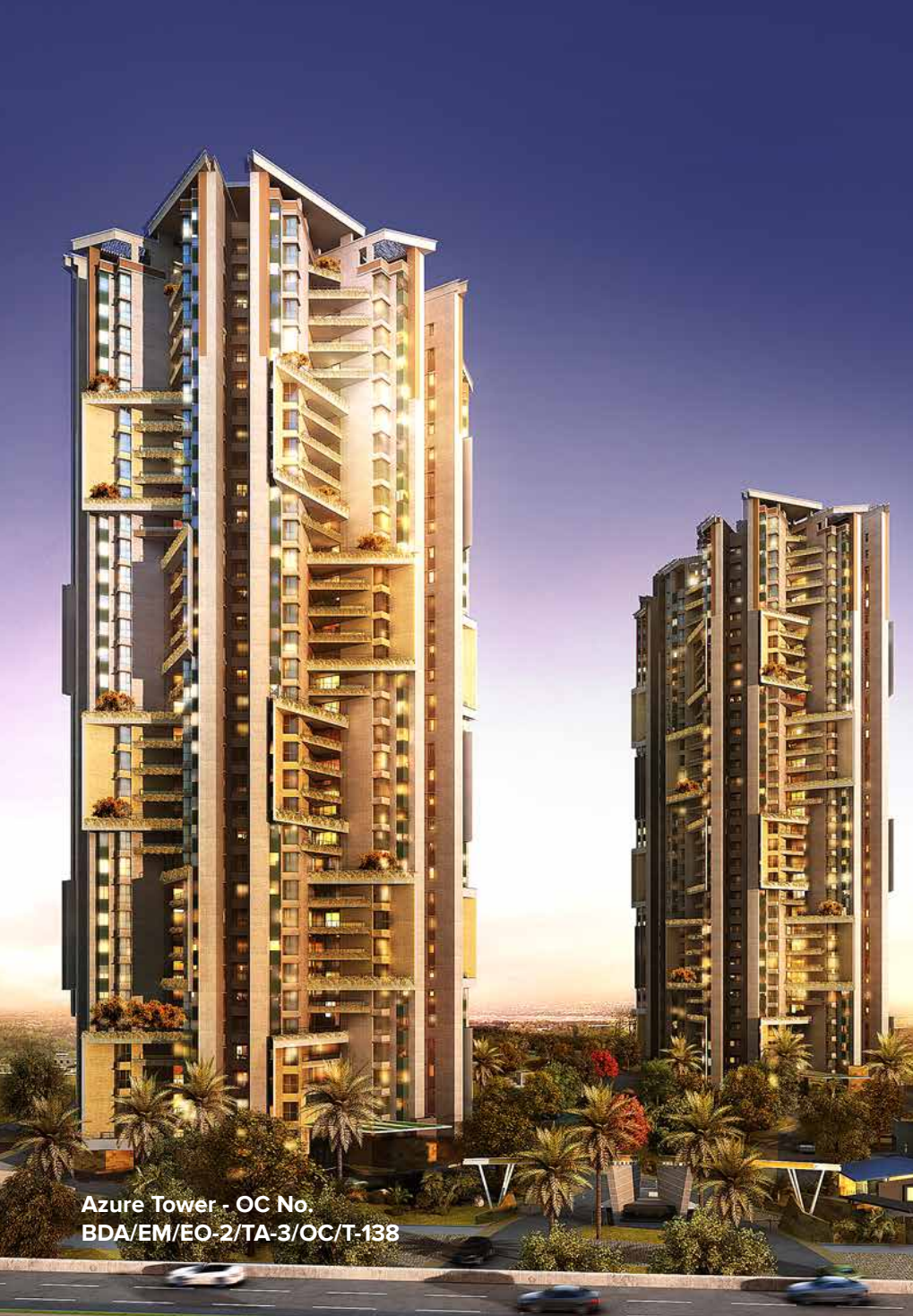
Azure Tower - OC No. BDA/EM/EO-2/TA-3/OC/T-138